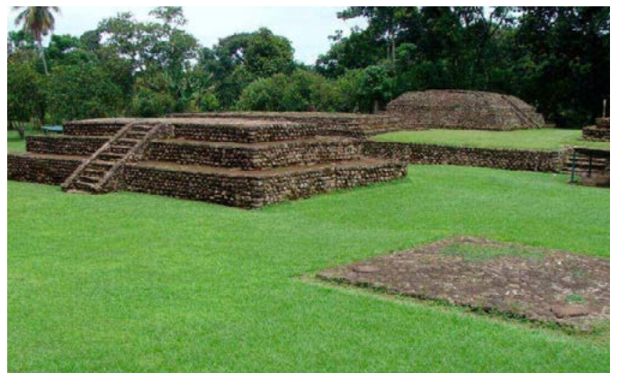
Fig.2- Stela 67 - Bearded First Ancestor Migration From Across Western Sea

A rope descends from the upper left down to beneath the boat and back up to the upper right side symbolizing that the boat is being guided by the heavens during its voyage. The rainbow around the bearded man reminds him that God made a covenant that He would not destroy the earth with a flood (as was done at the time of Noah).