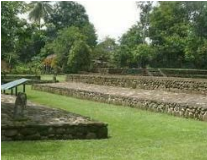
Fig. 3- Plaza F – Stela 67 left under the blue cover. - Izapa, Mexico