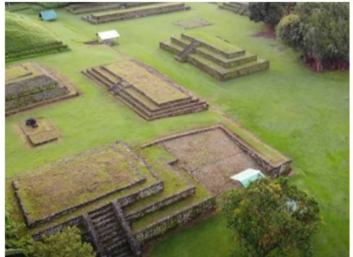
Fig. 4- Plaza F