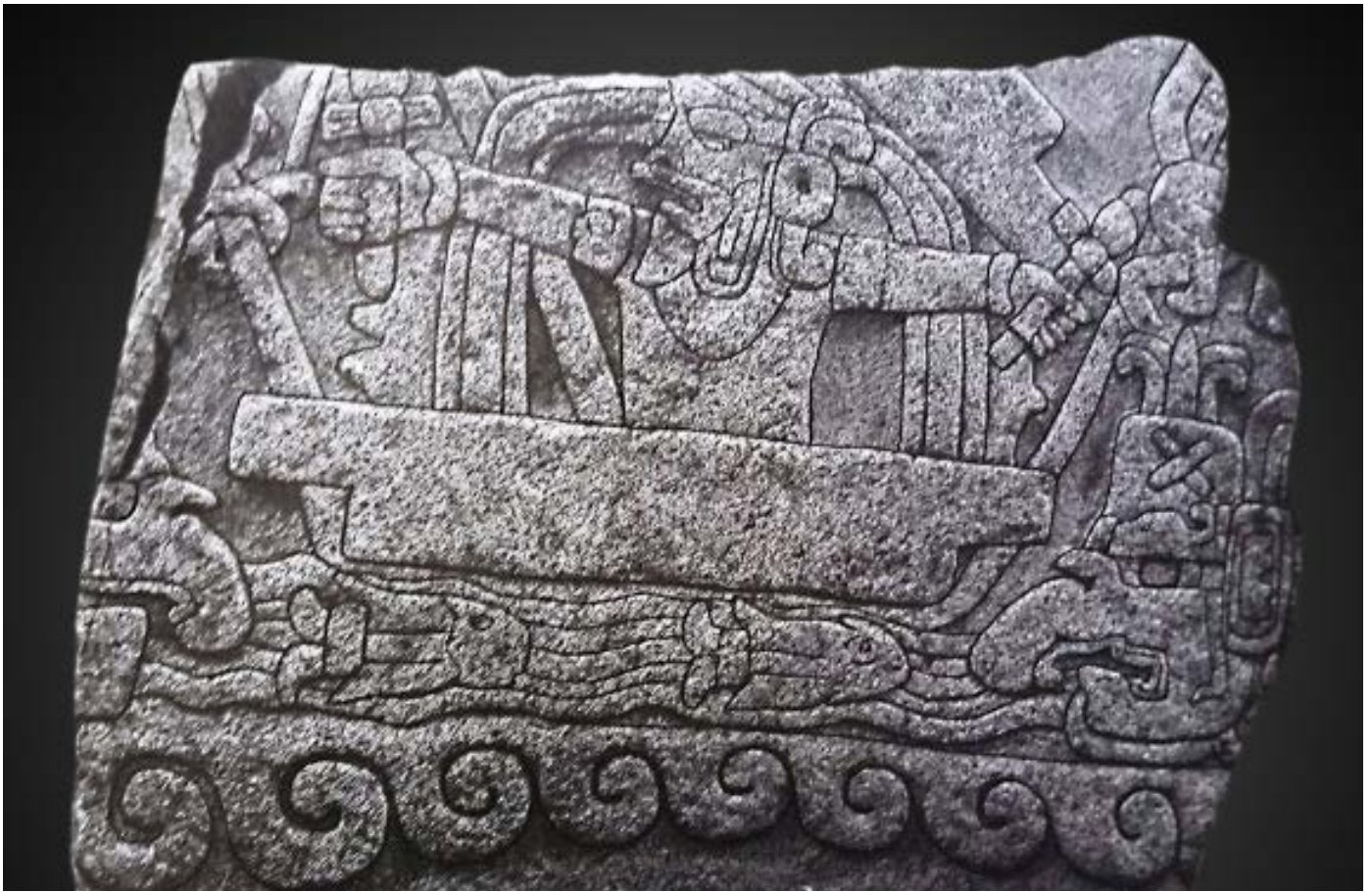
Fig. 1 – Izapa Stela 67